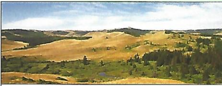
Cypress Hills Provincial Park The area encompasses mountains rising up 1,400 meters high, surrounded by flat plains and diverse mountain flora.