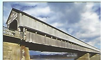
Hartland Covered Bridge The bridge over the St. John River was built in 1901 and is the world's longest covered bridge with a total length of 390 meters.