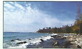
Lake Superior Provincial Park Natural trails and canoe routes stretch through this national park north of Sault Ste. Marie. The indigenous rock paintings on Agawa Rock near Highway 17 are a major attraction.