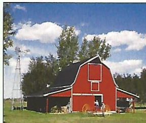
Fort la Reine This open-air museum village teaches visitors about 19th-century farm life on the North American prairies.