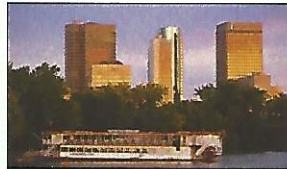
Winnipeg Manitoba's capital and largest city is located in a region of seemingly endless prairies. The city center has a mix of modern skyscrapers and 19th-century buildings around Old Market Square.