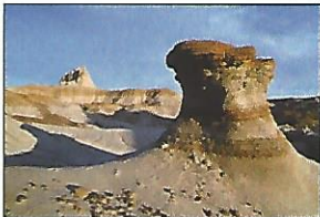
Dinosaur Provincial Park Numerous dinosaur fossils – some up to 60 million years old – have been discovered at this excavation site on the Red Deer River.