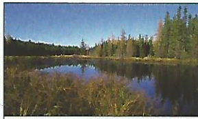
Riding Mountain National Park The national park is home to many wild animals, including wolves, lynxes, bears, elk, and buffalo.