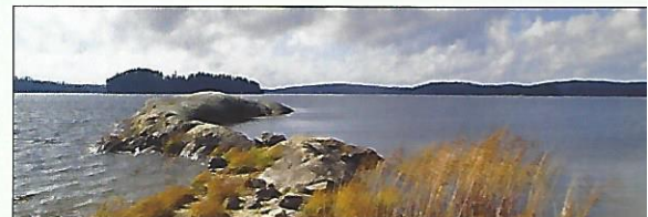
Quetico Provincial Park The park near Lake Superior and the United States Canada border encompasses 1,500 kilometers of canoe routes, including several historic routes once used by fur traders and early settlers.