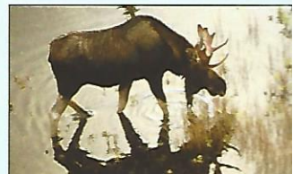
Cape Breton Highlands National Park Elk, beavers, and more than 250 bird species inhabit the 950-km² park.