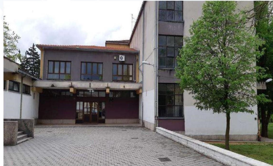
Dinka Šimunovića 14, 21230 Sinj, Croatia